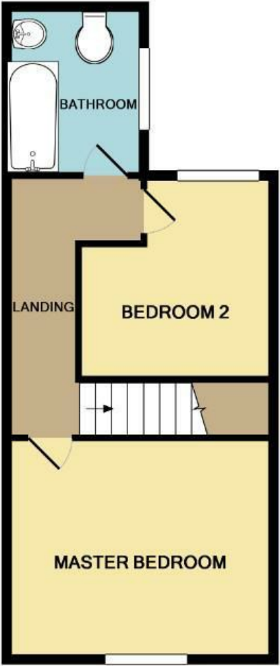
1ST FLOOR APPROX. FLOOR AREA 341 SQ.FT. (31.7 SQ.M.)

TOTAL APPROX. FLOOR AREA 731 SQ.FT. (67.9 SQ.M.)